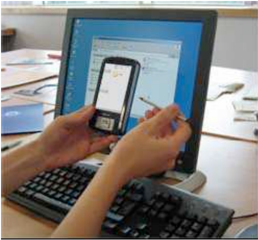
Figure 2: Transfer using display registration

This physical separation of handset and desktop, and the incumbent complexity for users in trying to connect between the two, is the problem addressed by this paper. Our vision is of a technology whereby the display of the handset could be treated as an almost indistinguishable part of the display of the desktop computer. For example, by holding the handset over the desktop's display, the content of the desktop screen below the handset appears on a region of the handset's display. Figure 2 illustrates the concept; a user holds the handset, equipped with rear-mounted camera, over the desktop. In doing so the user can see, on the handset, the contents of the display below it, and manipulate elements of this display as if they were elements of the handset's display itself. This functionality offers a wide range of applications, for example: