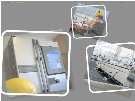
Figure 4: Start position of images on server display