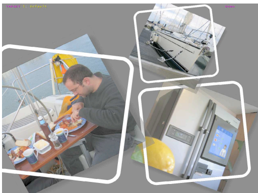
Figure 5: Target position of images on server display