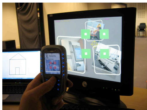
Figure 3: User tests