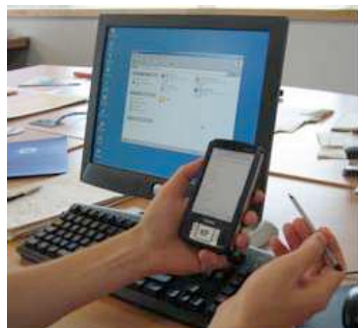
Figure 1: Transfer using separate application

as we might remotely access one desktop computer from another.