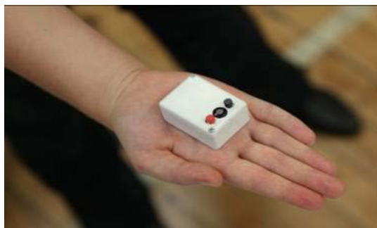
Figure 1. A prototype device shown as a prompt to elicit discussion about abstract concepts. Black and red buttons control vibration frequency on either side of an LED.

This scoping stage discussion lasted approximately one hour. Participants were organized into three small groups of three to five people. Focus Groups were carried out in an exploratory manner using open ended questioning to allow free flowing discussion to develop and mature into topics of interest. Participants discussed PD and the impact its symptoms could or did have on their use of technology. They also discussed their feelings towards medical devices and previous negative and positive experiences with them. Within the same session participants brainstormed the types of features they would or would not want in a drooling management device. They discussed specific features, collectively deciding on the best options for them and the reasons behind their choices. At the end of the workshop the participants were shown two prototypes to act as prompts intended to stimulate or provoke discussion about concepts such as device size or appearance. Prior to prompt showing, these concepts were abstract for the participants